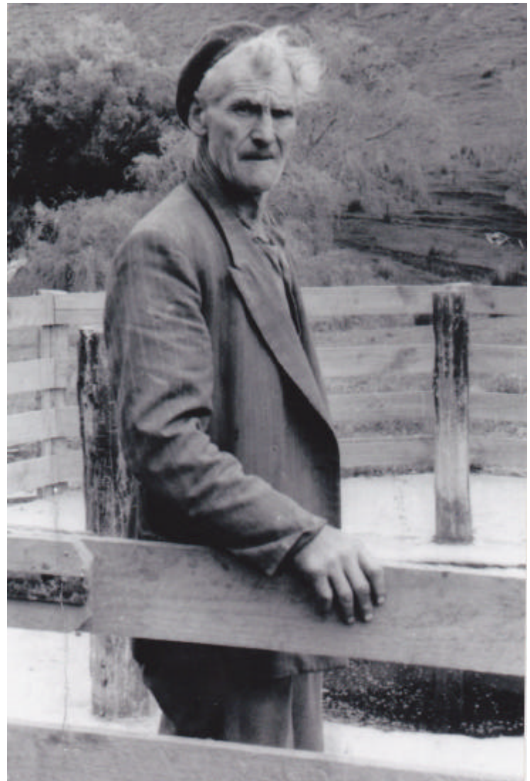
Dad at Fields Track, Parapara, Wanganui