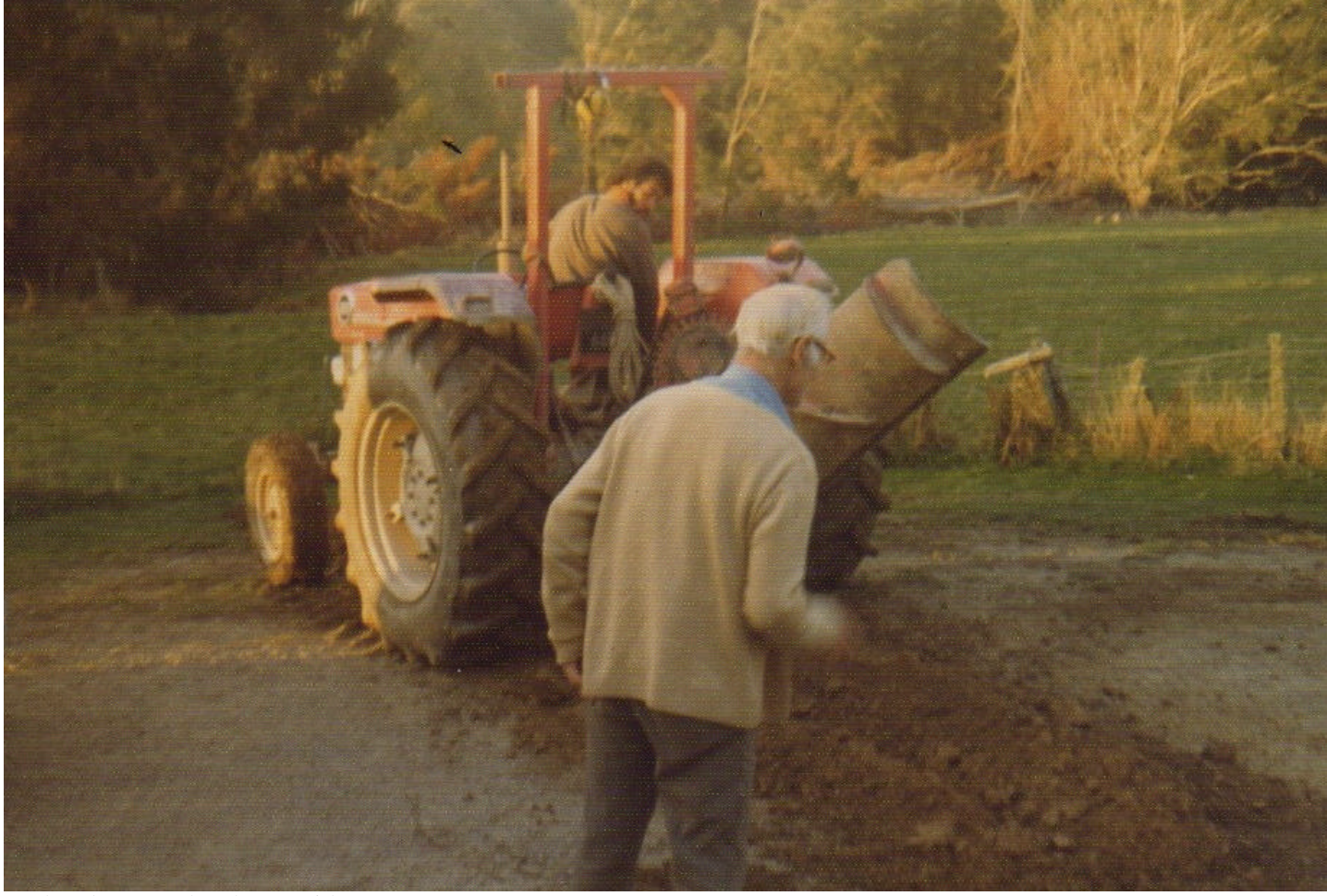
Dad and PB at Eketahuna mid 1970s