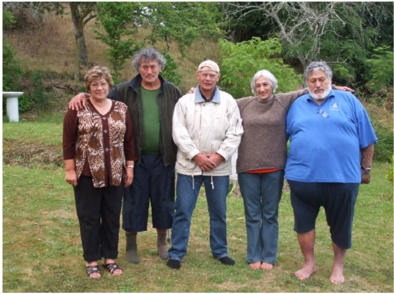
5 of the 6 Blacks in 2010 at Te Aute College